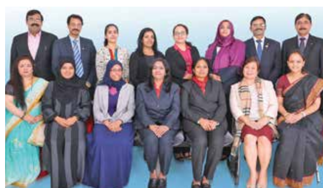
The organising committee of the event DT News Network Manama

Angels Toastmasters Club, the only ladies toastmasters club in Kingdom, is all set to host Confluence 2017.