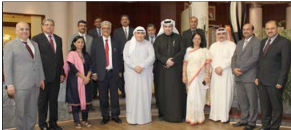
■ Officials at the board of directors meeting

LIC (International) also plans to shortly launch "an innovative medical product" which will also provide critical illness benefits from a broad range of illnesses.