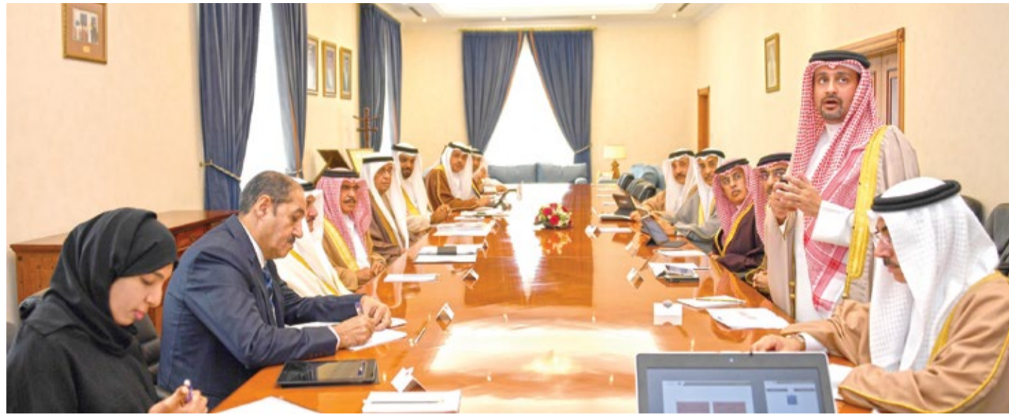
HH Shaikh Mohammed chairs the meeting.

new digital services in the Electricity and Water Authority (EWA), including services related to requests for reconnecting and moving to a new address without the need of personal presence of the beneficiaries of these services.