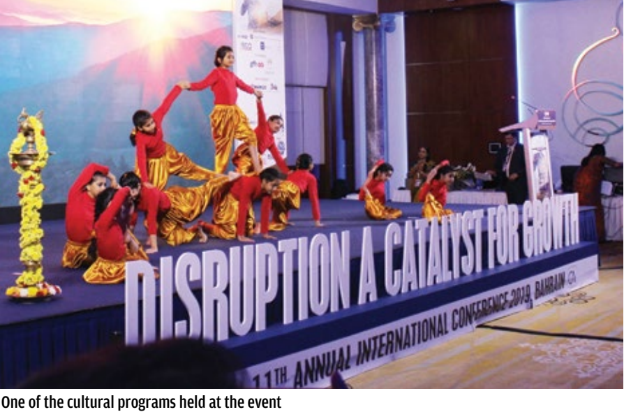
One of the cultural programs held at the event