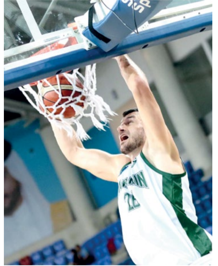
A player in action during the match

On March 5, two quarter-final games will be held with Muharrag facing Isa Town and Riffa going head to head with Mana-