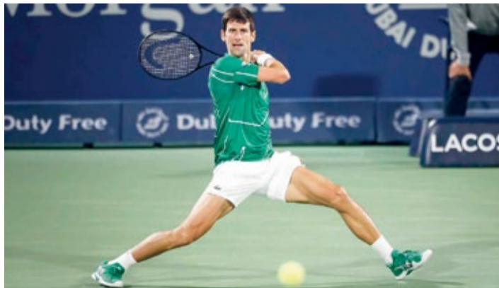
Novak Djokovic of Serbia hits a return to Gael Monfils of France

A double break in the opening set gave Monfils an early advantage as Djokovic dropped his first set of the tournament, failing to find answers when faced with Monfils' long reach and