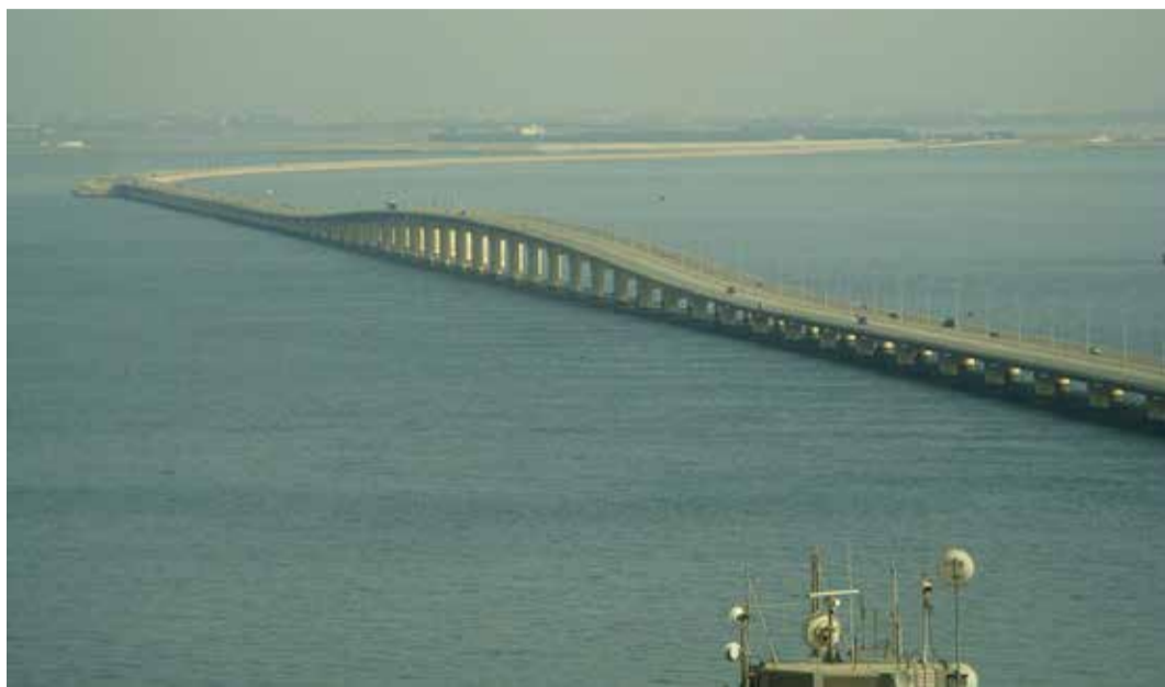
The 24km King Fahad Causeway is the only land link connecting Bahrain to other countries

"This would also contribute to the development and prosperity