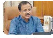
May 2023: The Indian Minister of State for External Affairs, V. Muraleedharan, visited Bahrain to attend the 14th Manama Dialogue. The Manama Dialogue is an annual security forum that brings together government officials, experts, and business leaders from around the world to discuss regional security issues.