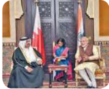
January 2023: The Indian Prime Minister, Narendra Modi, and HRH Prince Salman bin Hamad Al Khalifa, the Crown Prince and Prime Minister, held a virtual summit to discuss ways to further strengthen the bilateral relationship.