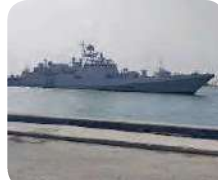
April 2023: The Indian Navy ship INS Tarkash visited Bahrain for a port call. The visit was part of the Indian Navy's "Mission Shakti" initiative to enhance maritime cooperation with friendly countries in the Gulf region.