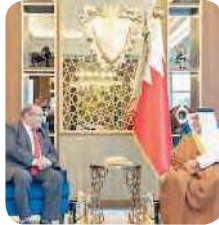
March 2023: The Indian Ambassador to Bahrain, Piyush Srivastava, paid a farewell call on the Crown Prince and Prime Minister.