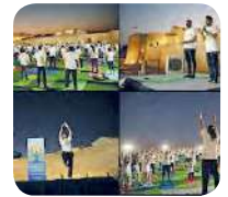
June 2023: The Indian Embassy in Bahrain organized an event to celebrate the International Day of Yoga. The event was attended by a large number of people from the Indian and Bahraini communities.