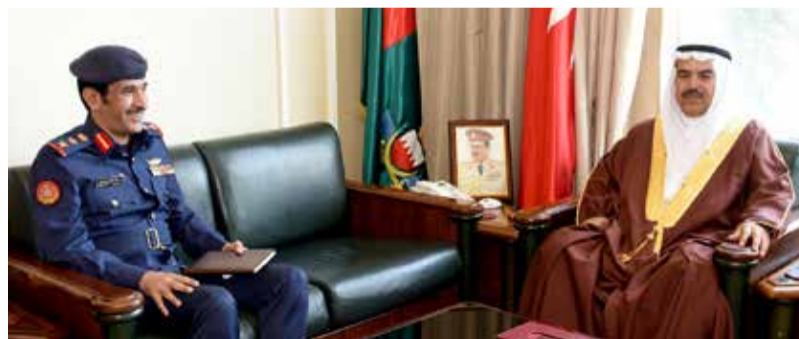
Defence Affairs Minister Lieutenant-General Abdulla bin Hassan Al Nuaimi received Kuwait's Military Attaché to Bahrain Colonel Pilot Abdullah Abdulrahman Al Aqaili. The meeting reviewed bilateral relations and steady cooperation in the military field. Left, the Defence Minister with the Kuwaiti military attaché.